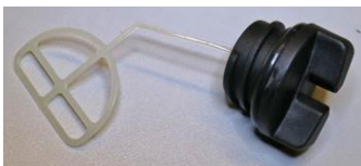
R021616 TANKLOCK KPL