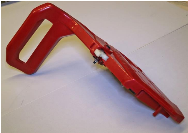
R021600 KASTSKYDD KPL