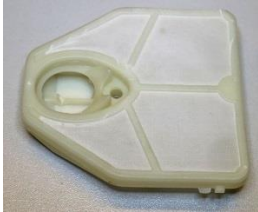
R021599 LUFTFILTER VIT PLAST