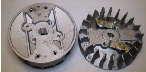
R021615 SVÄNGHJUL (bild från båda sidor)