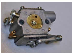
R021602 FÖRGASARE KPL