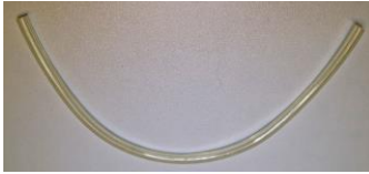
R021604 BENSINSLANG T PRIMER