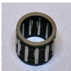
R021619 NÅLLAGER 10X13X13