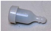
R021606 AVLUFTNING F. TANK