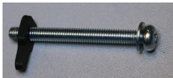
R022271 KEDJESPÄNNARSKRUV /MUTTER/TAPP