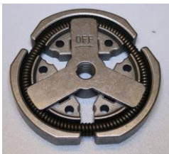
R021617 KOPPLING KPL