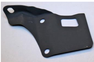
R021613 FÄSTPLATTA F. LJUDDÄMPARE