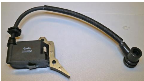
R021616 TÄNDSPOLE KPL