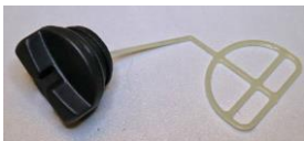
R021612 OLJELOCK KPL