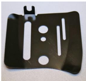
R022270 METALLSKYDD F. KEJDESPÄNNARE