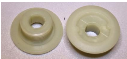
R021620 PLASTDREV T.OLJEPUMP (bild från båda sidor)