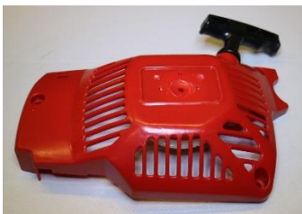
R021601 STARTAPPRAT KPL